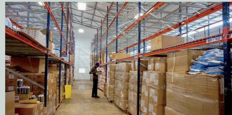
The new SBHF warehouse is centralizing and streamlining our supply chain, so we can be sure that patients and staff have consistent access to the medicines and supplies they need, when and where they need them.

When Hurricane Matthew washed out the only road connecting Fond des Blancs with the rest of the Southern Peninsula, it reinforced the precariousness of our hospital's remote, off-the-grid location and its inability to function without regular deliveries of diesel fuel for our two electrical generators. So, we were thrilled when, this July, we flipped the switch to turn on St. Boniface Hospital's brand new solar power system. The 600 panels and 130 batteries will provide approximately 60% of the energy needed to operate the hospital every day, with the generators filling the gap. We are hoping to expand the system in the future to fill even more of the hospital's energy needs with clean, safe, self-generating solar power.