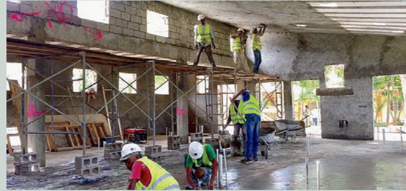
The new Center for Infectious Disease and Emergency Care is nearing completion, thanks to the hard work from our partners at Build Health International, and support from USAID's ASHA program.