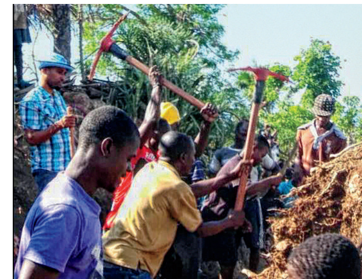
Residents of Dalmette help widen the road by hand so SBHF's mobile clinic team can reach their town.

Since the mobile clinics started in December our teams have seen 15,000 patients, provided 1,200 doses of lifesaving childhood vaccinations, and referred hundreds of people to health facilities and malnutrition treatment programs in order to get the specialized care they need.