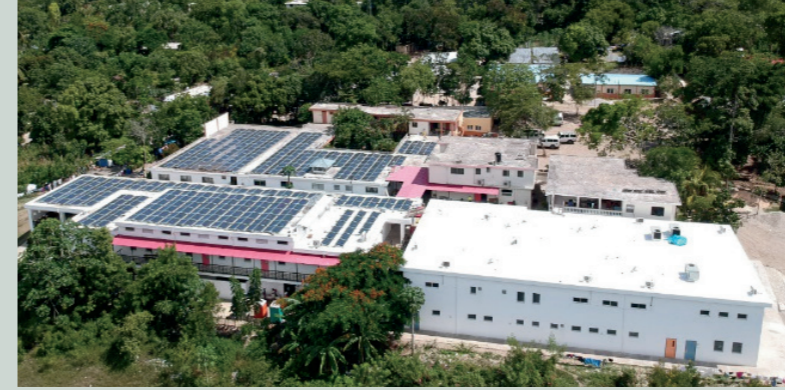
Solar Panels are filling 60% of St. Boniface Hospital's electrical needs, providing safe, clean, reliable and sustainable power for better patient care.

The center is now treating nearly 250 people each month, most of whom would have no other access to the surgical care they need. With your support our team will continue to provide excellent care to all who need it for many years to come.