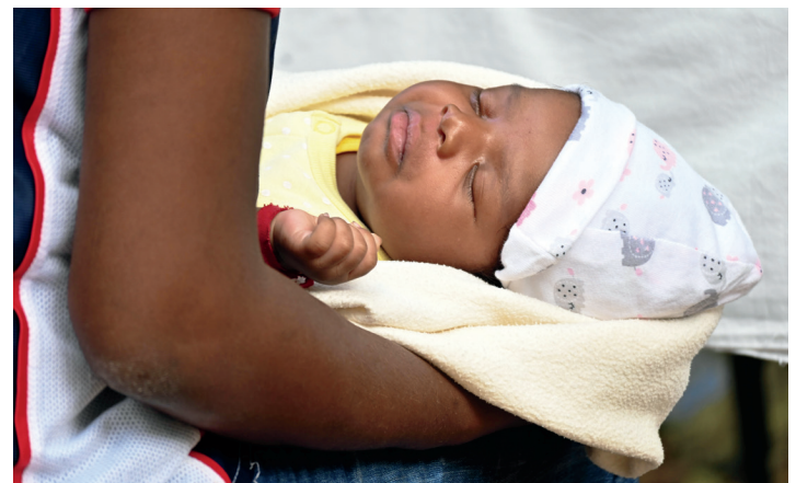
Our mobile clinics saw more than 34,000 pediatric patient visits from August 2021 to June 2022.

“ I THANK EVERYONE WHO MADE THIS MOBILE CLINIC POSSIBLE AFTER THE EARTHQUAKE. ”