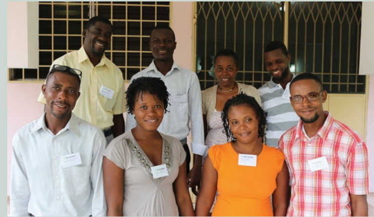
New Community Health Workers from Tiburon will provide care to people who have no other access to medical professionals.

community better. Our communities have not had community health workers, but we had all heard about how important they have been in other parts of the country and dreamed of having a community health worker program in Maniche. Now, people in our communities are proud that they will have this talented team to work with them against common diseases.