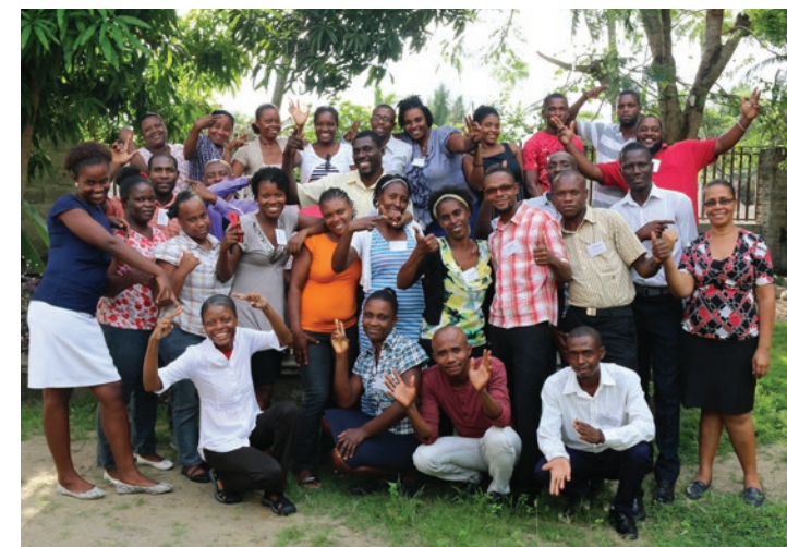
Twenty-six newly trained Community Health Workers will serve their home communities across southern Haiti.