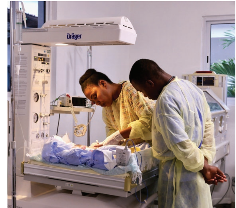
Parents tend to their child in SBHF's newly-renovated NICU.

But with just nine inpatient beds and a tiny, cramped NICU, our old pediatrics ward was constantly at or over capacity. Then, in 2016 Hurricane Matthew damaged many of Haiti's care facilities, and in 2018 Doctors Without Borders closed its maternity hospital. The number of children in our pediatrics department continued to soar as patients from these facilities