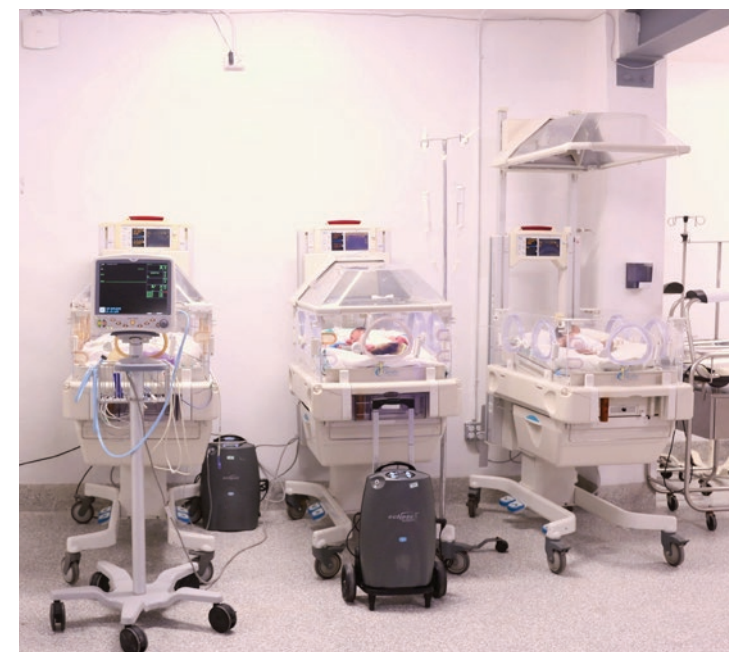
Incubators were carefully moved into the NICU one by one.