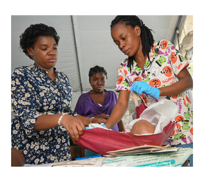
Miss Marie prepares to weigh a young patient.

SBH is the hub of the local health system in the Fond des Blancs area. As one of the only fully functioning hospitals on Haiti's southern peninsula, it is also central to the regional health system, and a key player in Haiti's national health system.