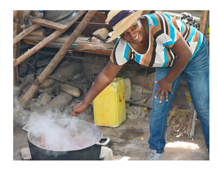
All smiles in the kitchen as the women of Ti Fwaye prepare dumpling soup.