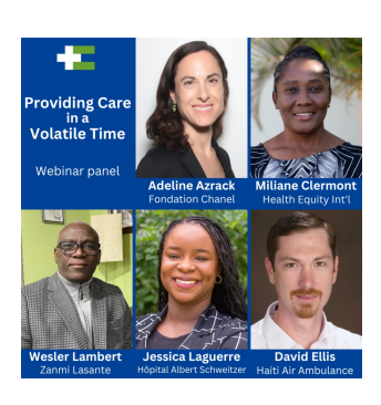
Providing Care in a Volatile Time